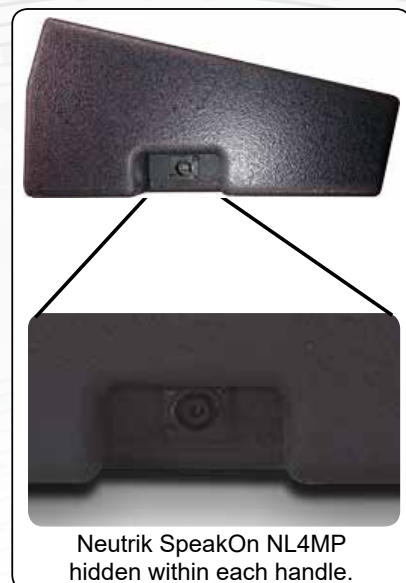
Neutrik SpeakOn NL4MP hidden within each handle.