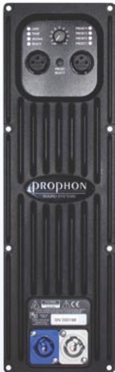
Picture showing the built-in 700W class-D amplifier module with full DSP processing and 4 presets for choosing different setups.

Bi-amplified or self-powered, multi function speaker