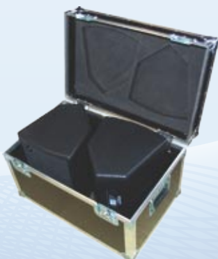
There are two different cases available, fitting two or four MF10