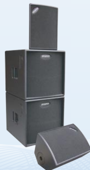
Picture showing two MF10A in an active rig with two B1HPA self-powered subwoofers